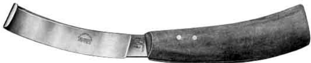
No. 2.— \frac{3}{4} " SINGLE EDGE.