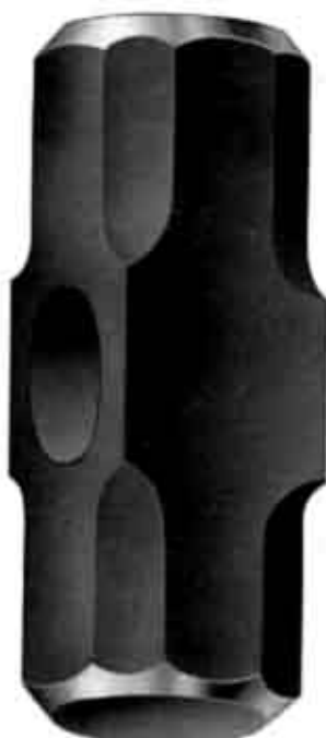
No. 15S. DRILLING HAMMER.