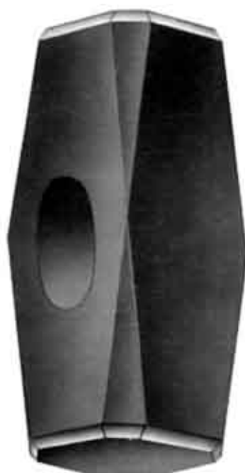
No. 71.- S.F. SQUARE FACE MINING HAMMER.