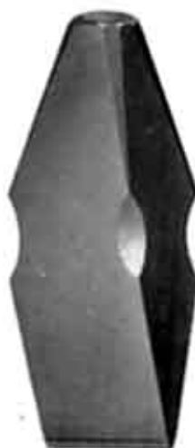
No. 31. COLD SATE.