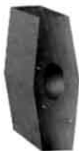
No. 83. GRANITE HAMMER.