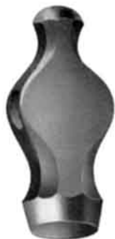
No. 22. BALL PANE.