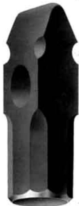
No. 11. CROSS PANE.