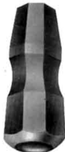
No. 30. CUP TOOL.