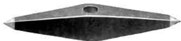
No. 2. CORNISH GRANITE PICK.