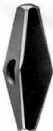
No. 70. OVAL EYE.