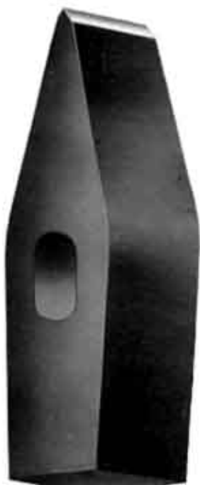
No. 60. CUTTING OR SPLITTING HAMMER.