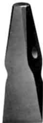
No. 32. HOT SATE.