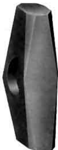
No. 362. MASONS' PUNCH HAMMER.