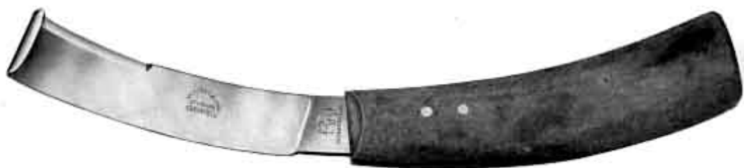
No. 1.— \frac{3}{4} " DOUBLE EDGE.