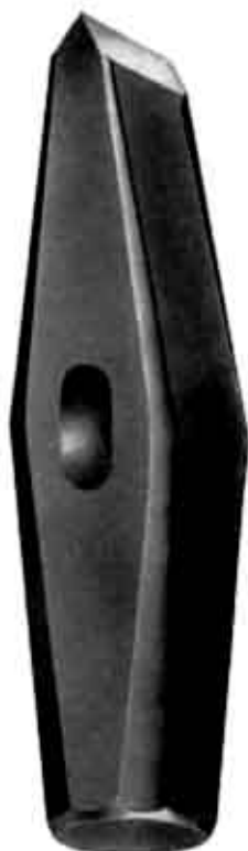
No. 65. PANE END QUARRY-DRIVING HAMMER.