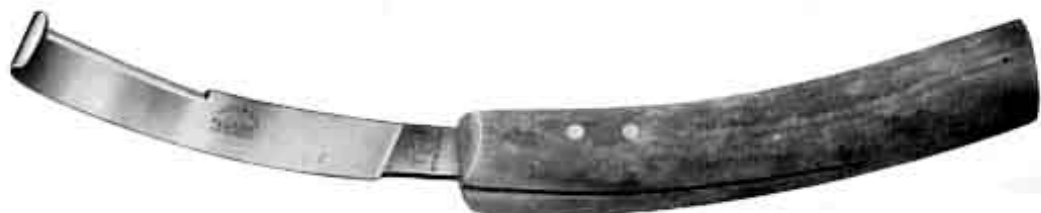
No. 3.— \frac{3}{4} " DOUBLE EDGE.