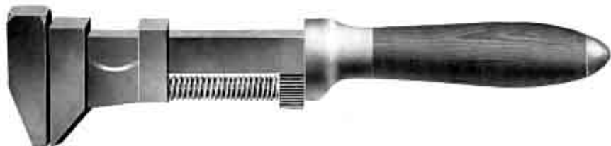
No. 1. GERRARD'S PATTERN SCREW WRENCH.