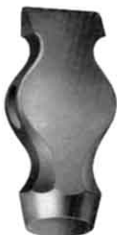
No. 9. STRAIGHT PANE.