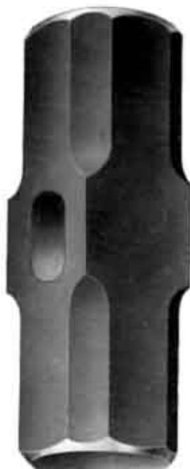
No. 15 or 27. DOUBLE FACED SLEDGE.