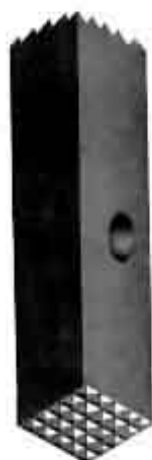
No. 363. CROWN-FACE HAMMER.