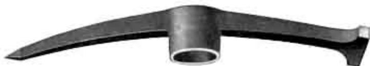
No. 3. RAILWAY BEATER PICK.