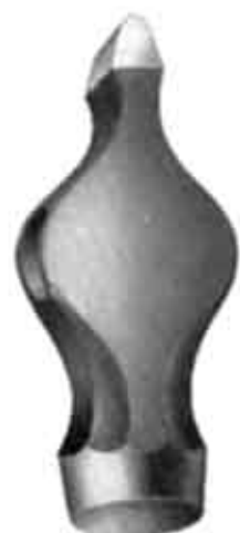
No. 8. CROSS PANE.