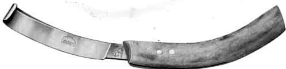
No. 4.— \frac{3}{4} " SINGLE EDGE.