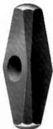
No. 70G. ROUND EYE.