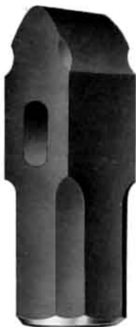
No. 12 or 26. STRAIGHT PANE.