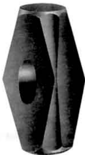
No. 71. MINERS' HAMMER.