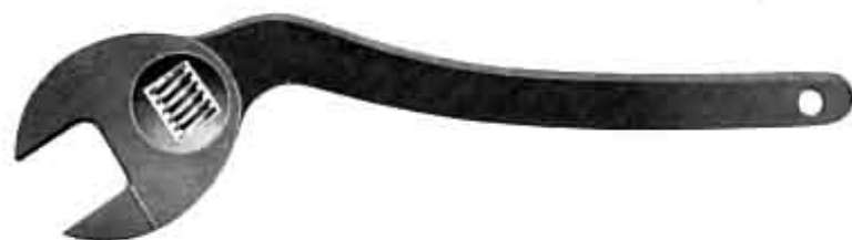
No. 4. GLYBURN PATTERN.

DROP-FORGED. SINGLE OR DOUBLE END. JAWS UNPOLISHED OR POLISHED.